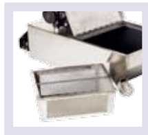
large crumb collection basket